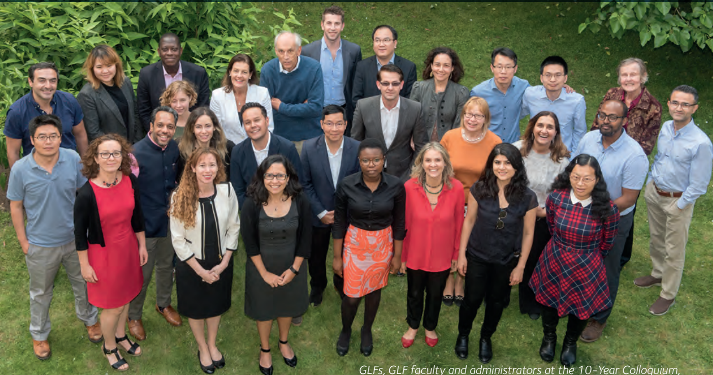
GLFs, GLF faculty and administrators at the 10-Year Colloquium, Oxford, June 2018.

Leadership is a scarce but critical global resource. Warfare, refugee crises, economic inequality, epidemics, and climate change are some of the many pressing issues that have impacts both within and across national borders. They cannot be solved without effective policymaking on all fronts – particularly, in the developing world. Effective policymaking, in turn requires strong policy-facing research institutions that can advise governments and contribute to global policy agendas. However, most relevant institutions are located in North America and Europe, largely inaccessible to potential leaders in Africa, Asia, the Middle East, and South America.